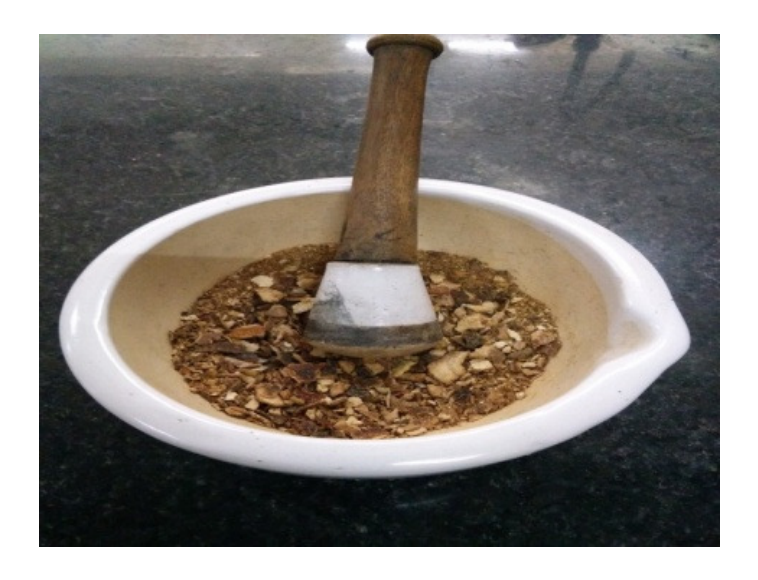
Table 1: Effect of concentration and percentage removal of Cd (II)